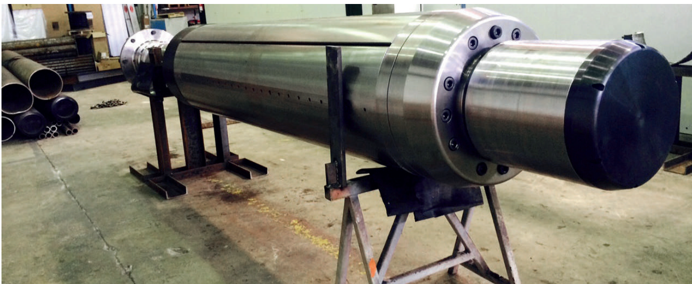
MANDREL Ø 762 x 2050